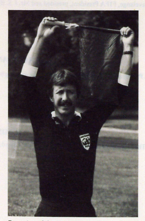
Front view of the Linseman signalling to the Referee when a substitute is waiting at the lines.