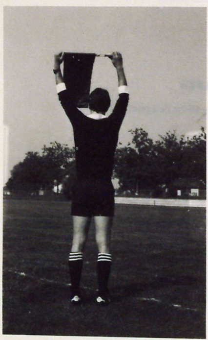
Backview of the Linesman signalling to the Referee for a substitution to be made.